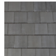
Slate Grey Code: 10001789

** (S/S) Stainless Steel Annular ring shanked (A/A) Aluminium Alloy