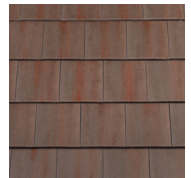
Rustic Brown (coated) Code: 10001791