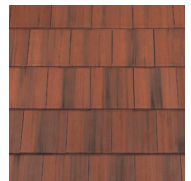
Flame Red (coated) Code: 10001790