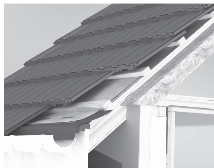
Habitable roof space (hybrid)